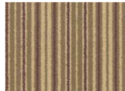
8ST/38267 sherbet limes