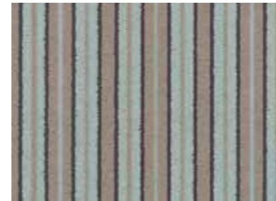
2ST/38268 chocolate fudge