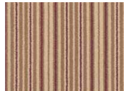
1ST/38267 raspberry ruffles