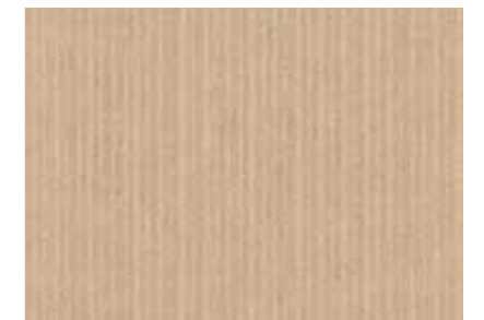
392ST/38265 leighton strand

S This symbol indicates the plain carpets from our ranges that have been specifically designed to co-ordinate with The Stripes Collection (see pages 32-39).