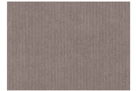
180ST/38265 pewter strand