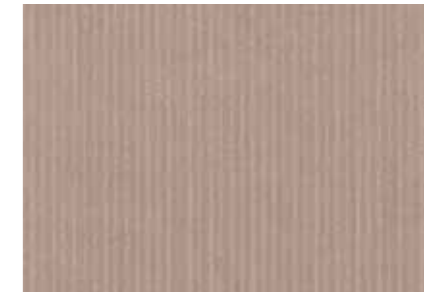
382ST/38265 mink strand