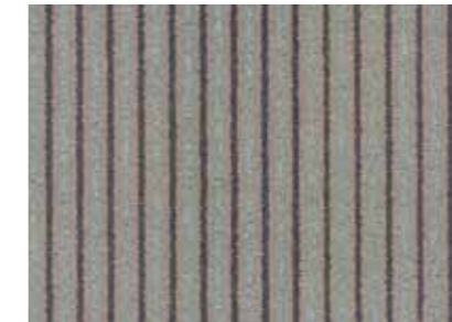
2ST/38266 chocolate bonbon