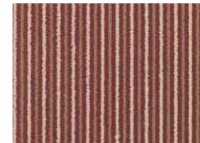
1ST/38266 rhubarb custard