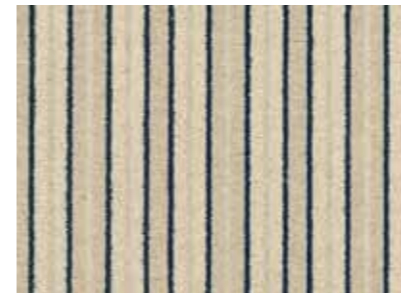
9ST/38268 brighton rock

N NEW - The Stripes Collection is a new range for 2008.