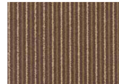
8ST/38266 chocolate limes