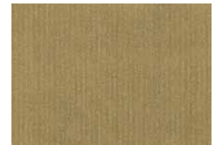
654ST/38265 gainsborough strand