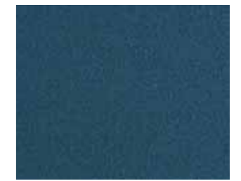
EV583 ocean blue