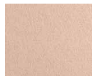
EV492 off white