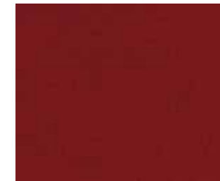
EV41 gallery red