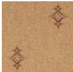
176/22123 kashmir gold