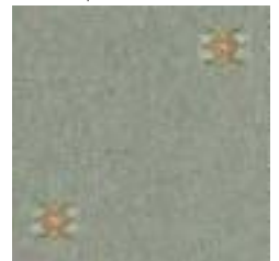
511/28035 khalyk green