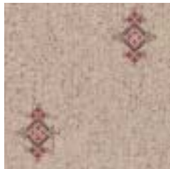
42/22123 kashmir ivory