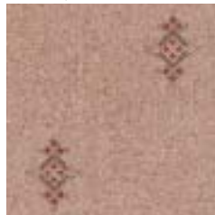
28/22123 kashmir fawn