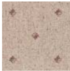
42/22125 kadiz ivory