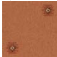
256/28034 kasbah sun