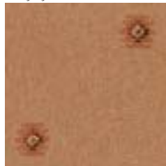
48/28034 kasbah spice