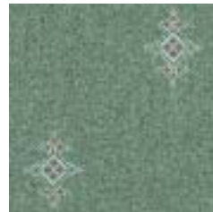
204/22123 kashmir jade