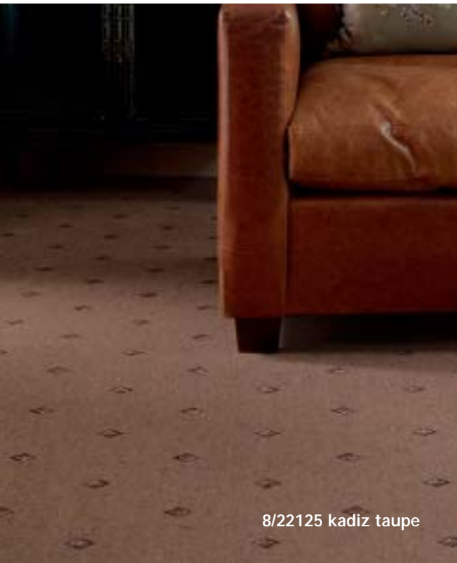
8/22125 kadiz taupe