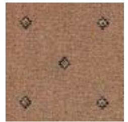
8/22125 kadiz taupe