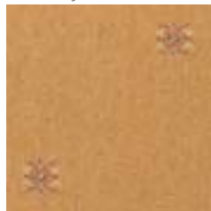
26/28035 khalyk yellow