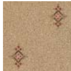
186/22123 kashmir sand