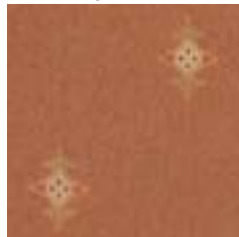
177/22123 kashmir bronze