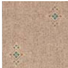
22/22123 kashmir beige