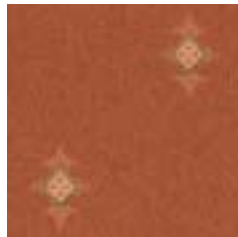
197/22123 kashmir rust