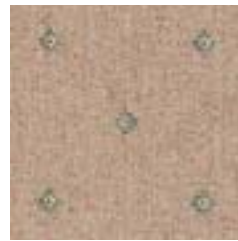
22/22125 kadiz beige